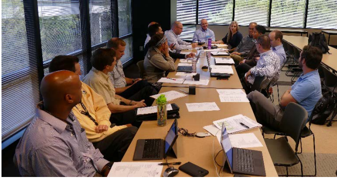
ITS Georgia board meeting, March 30, 2016

Our members are heavily invested and give freely of their time. Our Board and Officers are comprised of 18 individuals, each of whom has a committee assignment. Additionally, many of our members chair or serve on one of our committees, which have Board member oversight. In addition to paying annual membership dues, a record 46 member organizations provided additional financial support through various sponsorship opportunities or by exhibiting at our 2015 annual meeting.